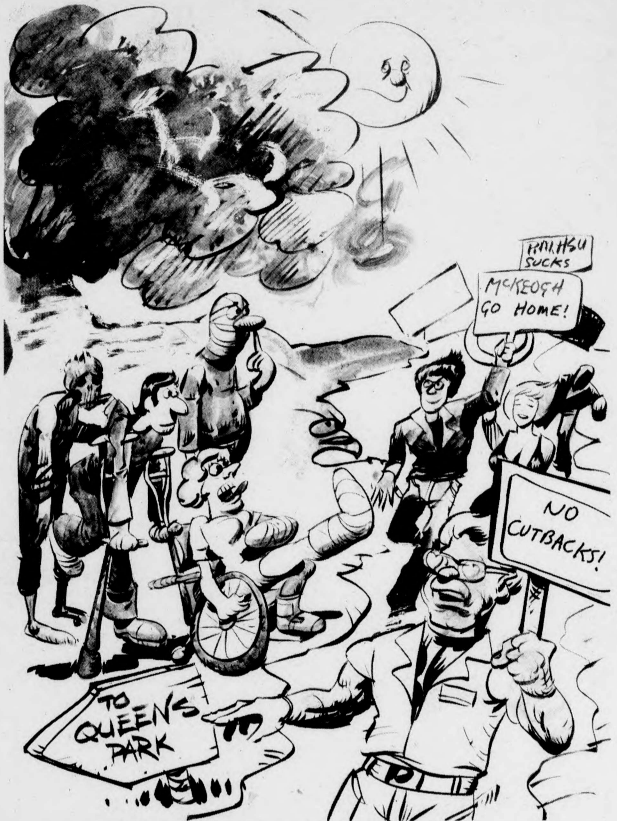
Helpless patients sadly look as students cry, "McKeough's a crook!"

For, economic crisis or no, what we really need are good, accessible universities. And money alone isn't going to provide them.