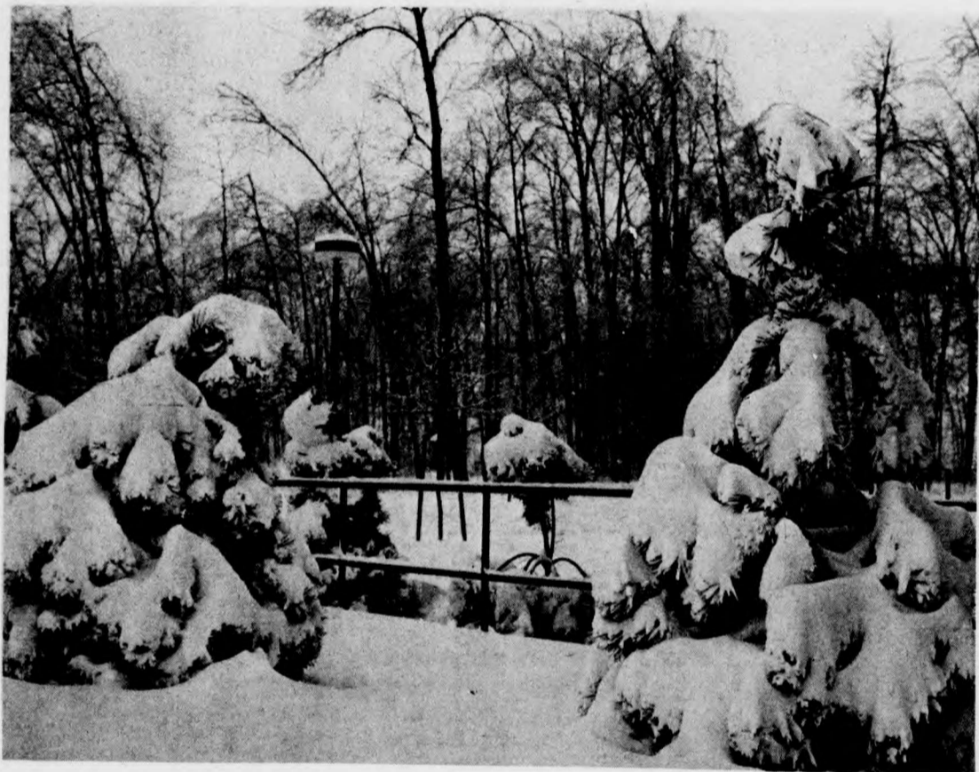
... and it snowed ...

Just disregard the profs that burst through the basement curtains from the tunnel in Burton--you must be dreaming.