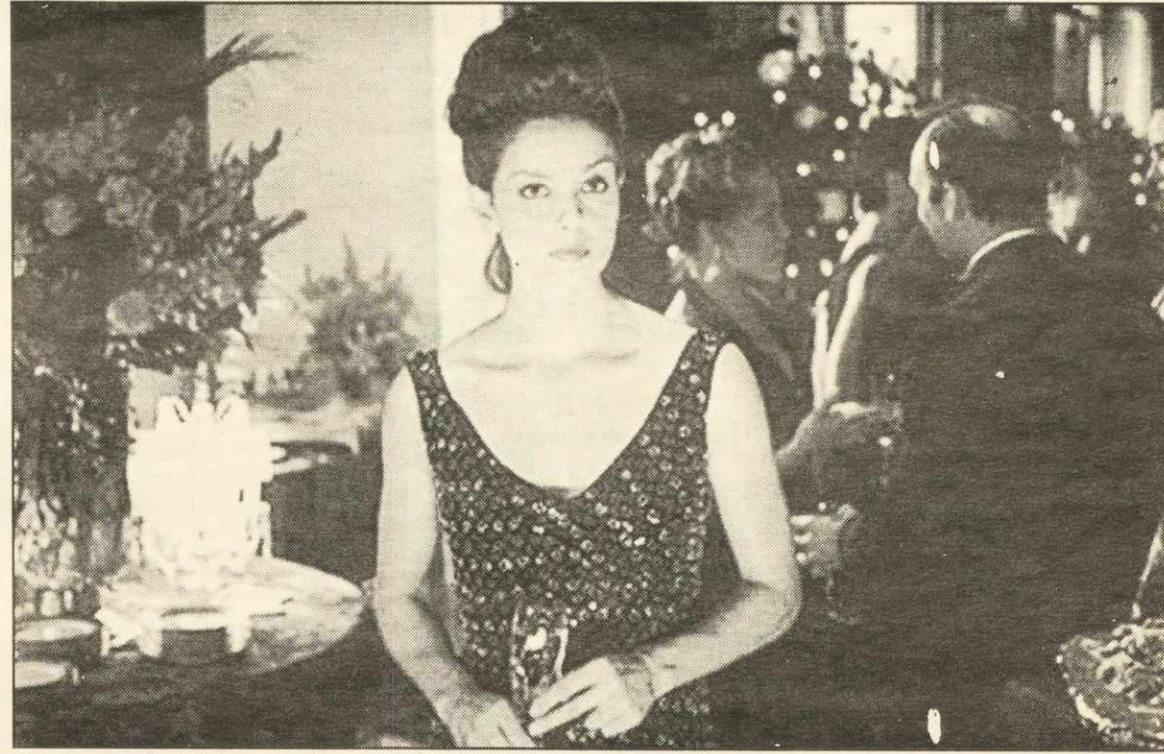
That dress! Ashley Judd stoops to play a well-dressed wife in search of revenge and/or justice.

Oh, and for those of you keeping track, the end of this film parallels that of Blue Streak , proving that these types of movies