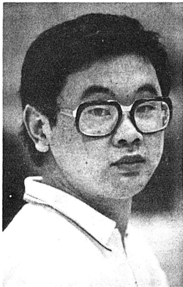
"In Japan, we see sport as an education, not merely as leisure. In Canada...people don't have to work that hard."

Ota likes the Canadian "system" of sports as opposed