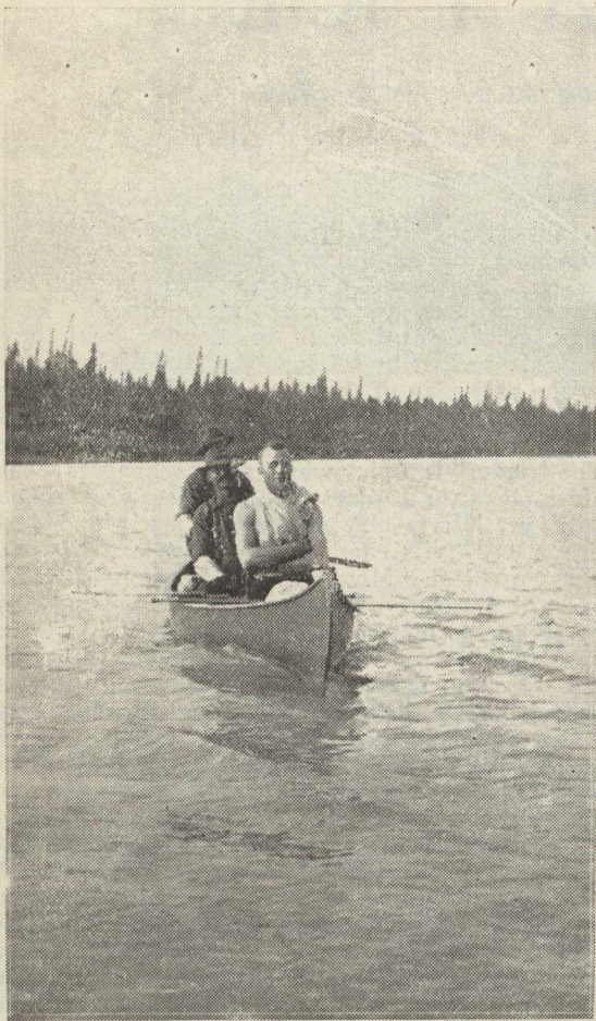
On Slim Creek, seven miles from Frederick-House River.