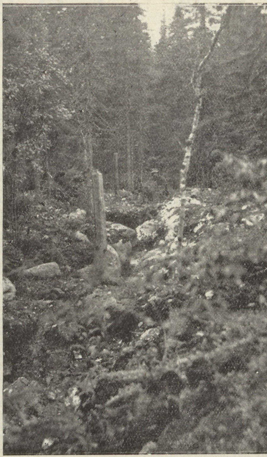
At this point between Whitney and Tisdale the first Free Gold was found.