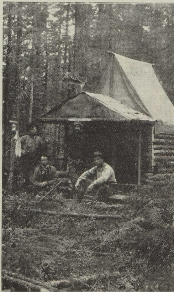
This is the first building put up in Whitney Township, near Porcupine Lake.

Two big mining companies have each twenty-five men busy developing. And the yarns they are telling of the quartz dykes over a thousand feet long and twenty feet wide, with free gold peeping out clear across—! Well, there'll be a lot of hands