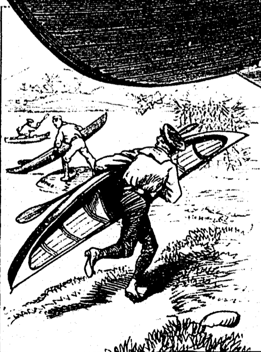
LAND AND WATER RACE.