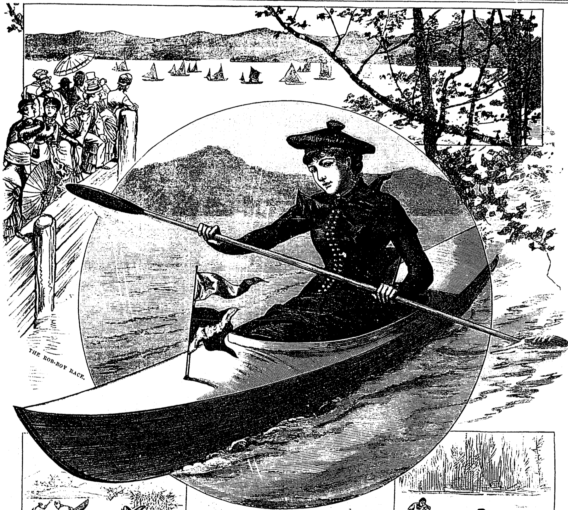
THE ROB-ROY RACE.

{ SINGLE COPIES, TEN CENTS. $4 PER YEAR IN ADVANCE.