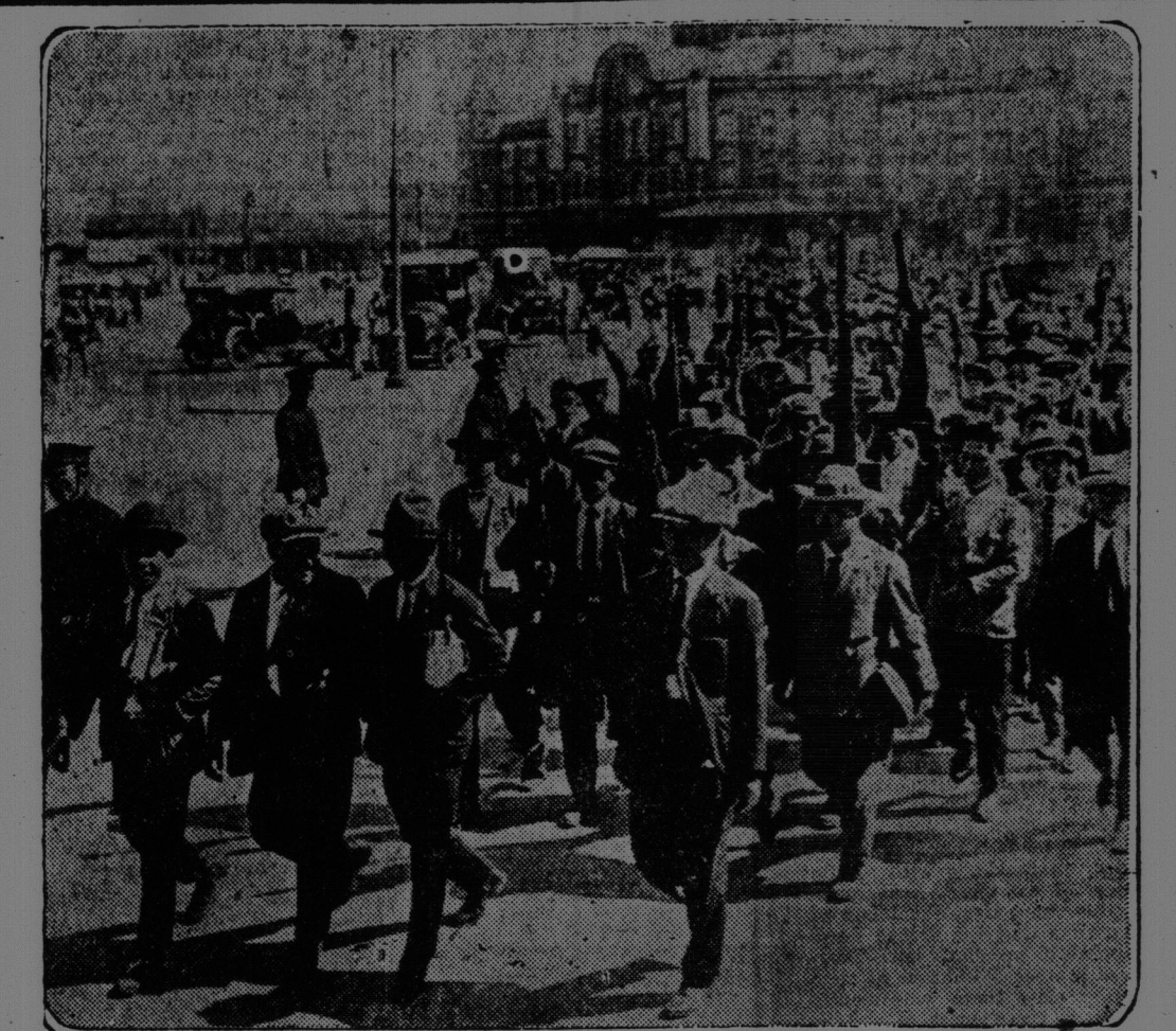
A Fascisti movement patterned after that which made Mussolini master of Italy, is gaining momentum in Japan, it is indicated by dispatches. Photo shows youthful advocates of movement, gathered from all parts of the empire for a demonstration, marching from the Tokio railway station under the watchful eye of police.

PREMIER KING WILL JAPAN UNEASY AS FASCISTI MOVEMENT GAINS MOMENTUM.