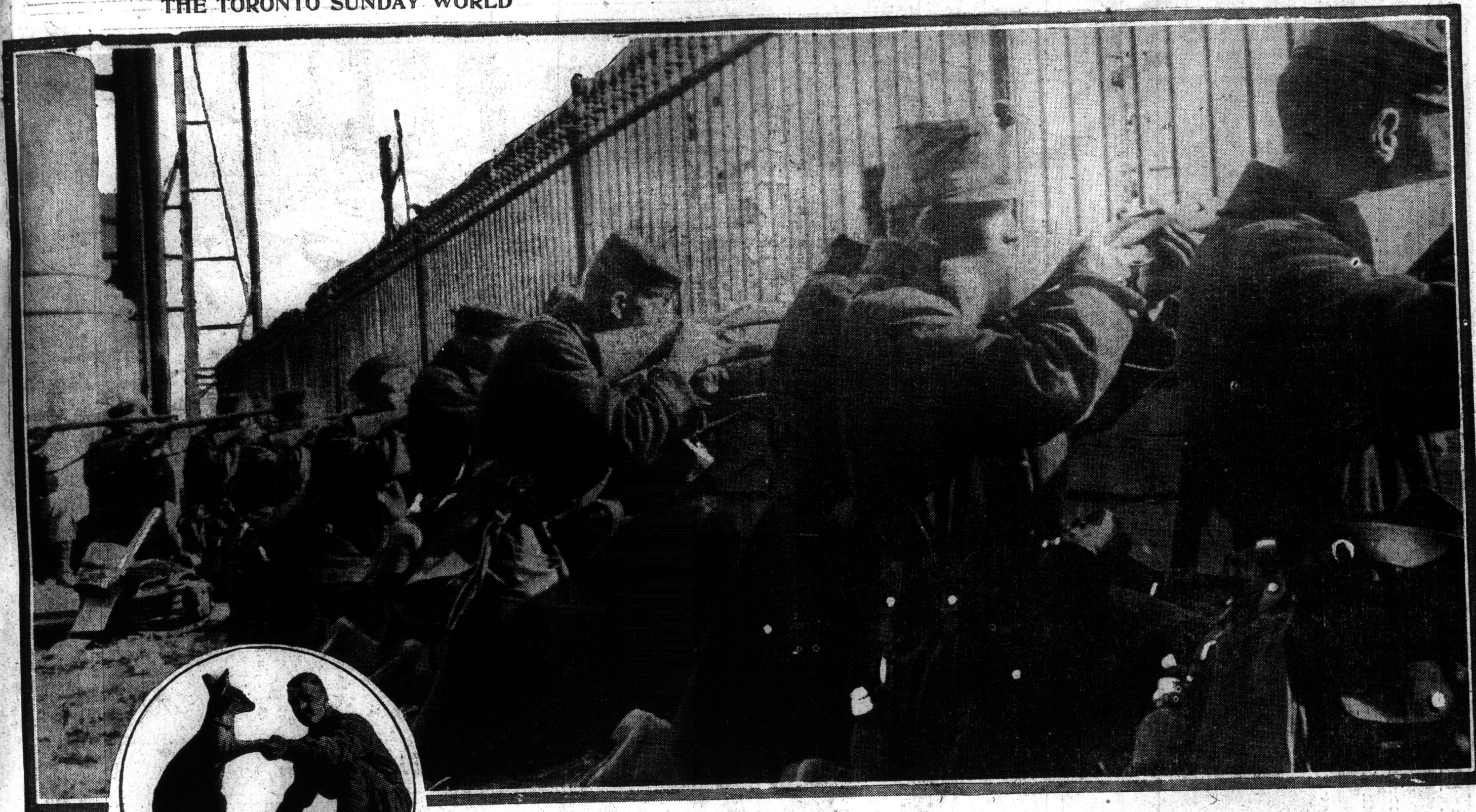
Belgian soldiers holding a canal from the Germans a hundred yards away. An interesting kodak snap.