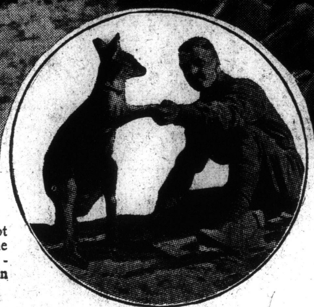
A mascot of the Austrians in Egypt.