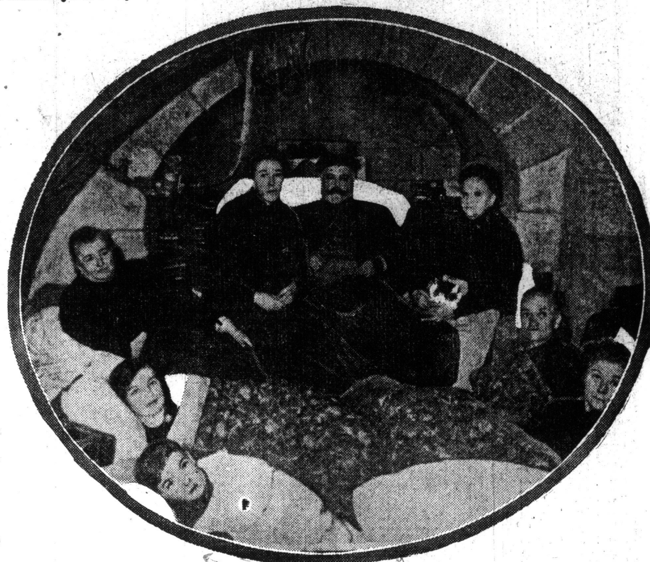
Amid wine bottles and cobweb—A Soisson's family living in the cellar of their home.