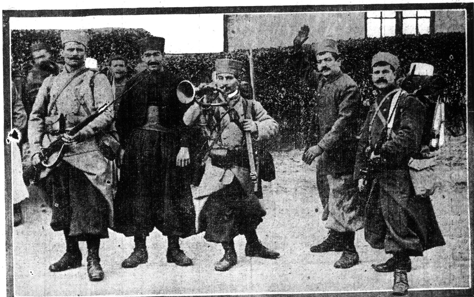
How the Zouaves—as shown by a party ready for the fray—look in their new khaki uniforms. They still retain