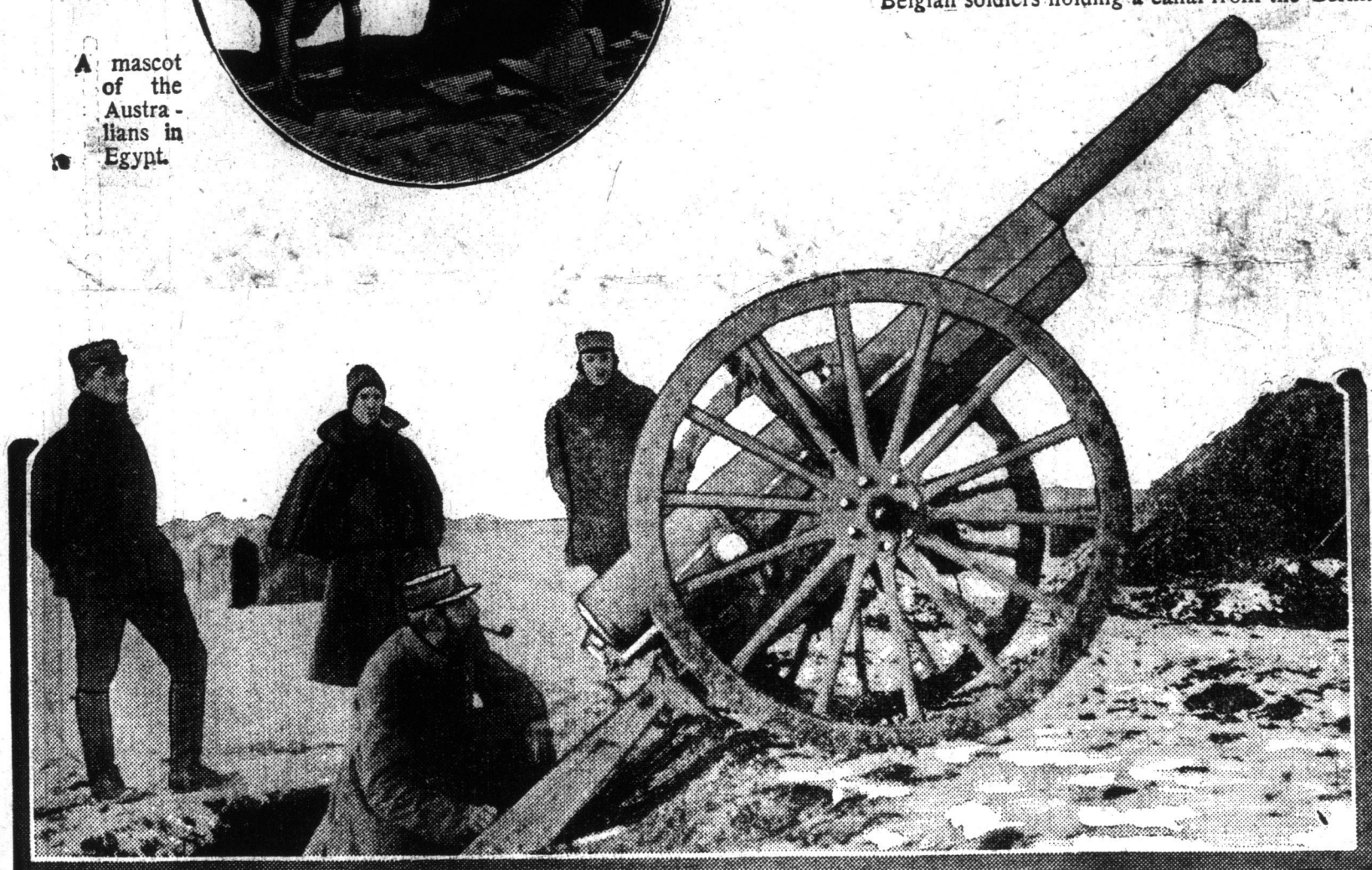
French artillery in action—Owing to the great elevation at which the gun is fired a pit must be dug for the gunners.