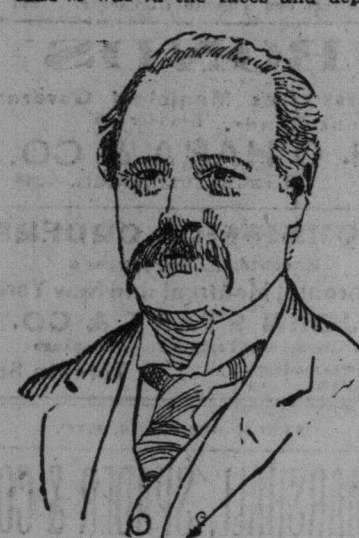
Victoria Old Boys

Lindsay, Aug. 1.—(Special.)—Lindsay to-day suffered an invasion to which it joyfully surrendered in the shape of the Victoria County Old Boys' Association of Toronto. Great indeed must have been the expectations of the visitors if they were not fully rea personal, acorded them to-day. The town was in gaia attire for the reception, and welcome was not more plainly spelled on banner and address than it was in the faces and deport