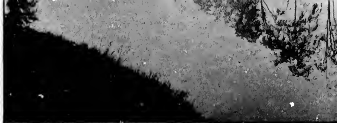
EVENING VIEW AT ST. JOHNS, P.Q.

settler had levelled many of the giants of the forest and laid the foundation of the number of prosperous towns and villages which are now scattered along the banks of the river. This peaceful time was somewhat broken by a period of suspense, culminating in the war of 1812. This war was of great interest to the people of the Richelieu valley; the action at Lacolle Mill, especially being a great fiasco, as (in the darkness of a night attack on Lacolle Mill) they mistook their own troops for the enemy, and, after some obstinate and bloody fighting, finally fell back to Champlain.