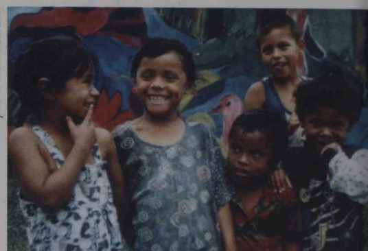
Children in front of a mural in Esteli, Nicaragua

In Alagoas, Brazil, CFC works with Zumbi dos Palmares Centre for the Defence of the Rights of Children. The aim is to educate the public about children's rights, bring to light cases of violence against children and provide legal support for children charged with crimes. The project also pressures the Brazilian government to enforce its Statute on Children and Adolescents, educate children and youth about their rights, protect adolescent workers, and end child labour.