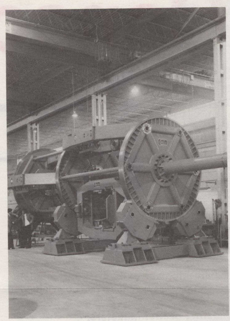
Heavy duty rope closer with reel for 50-tonne capacity.

manufacturing plants each machinist has been trained to operate several machine centres, so one person can achieve optimum production each day. This provides an edge in international competition and means that, despite the cyclical nature of the capital goods industry, Ceeco's manpower remains relatively constant. People are moved to where the work is.