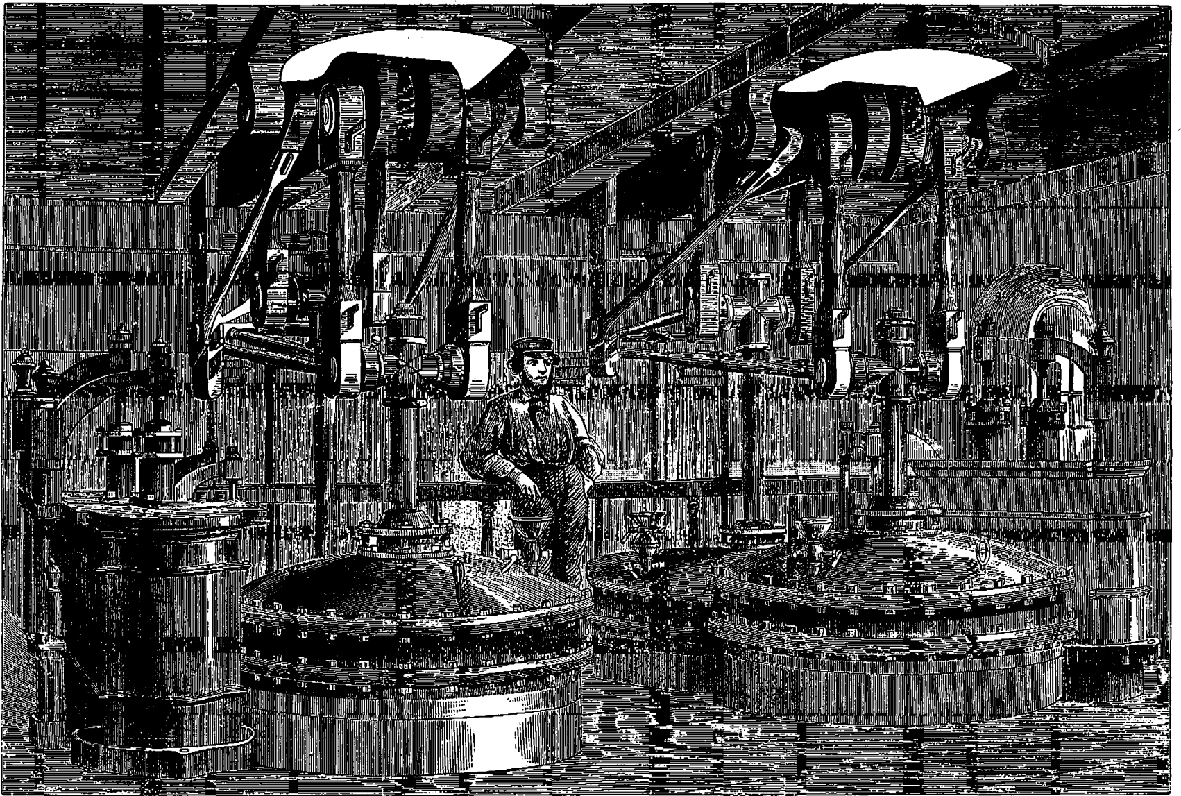
SECTIONAL VIEW OF ENGINE.

A CLAM-BAKE.—Clam-Bakes are of frequent occurrence in the Atlantic States; but we presume few of our readers have ever seen the preparation of such a feast. We therefore copy the following description:—