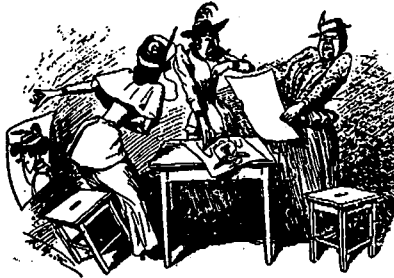
GENERAL CHORUS— "Oh, get out! Is that intended for me?"