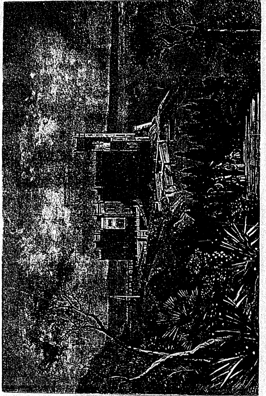
THE CASTLE OF MIRAMAR.