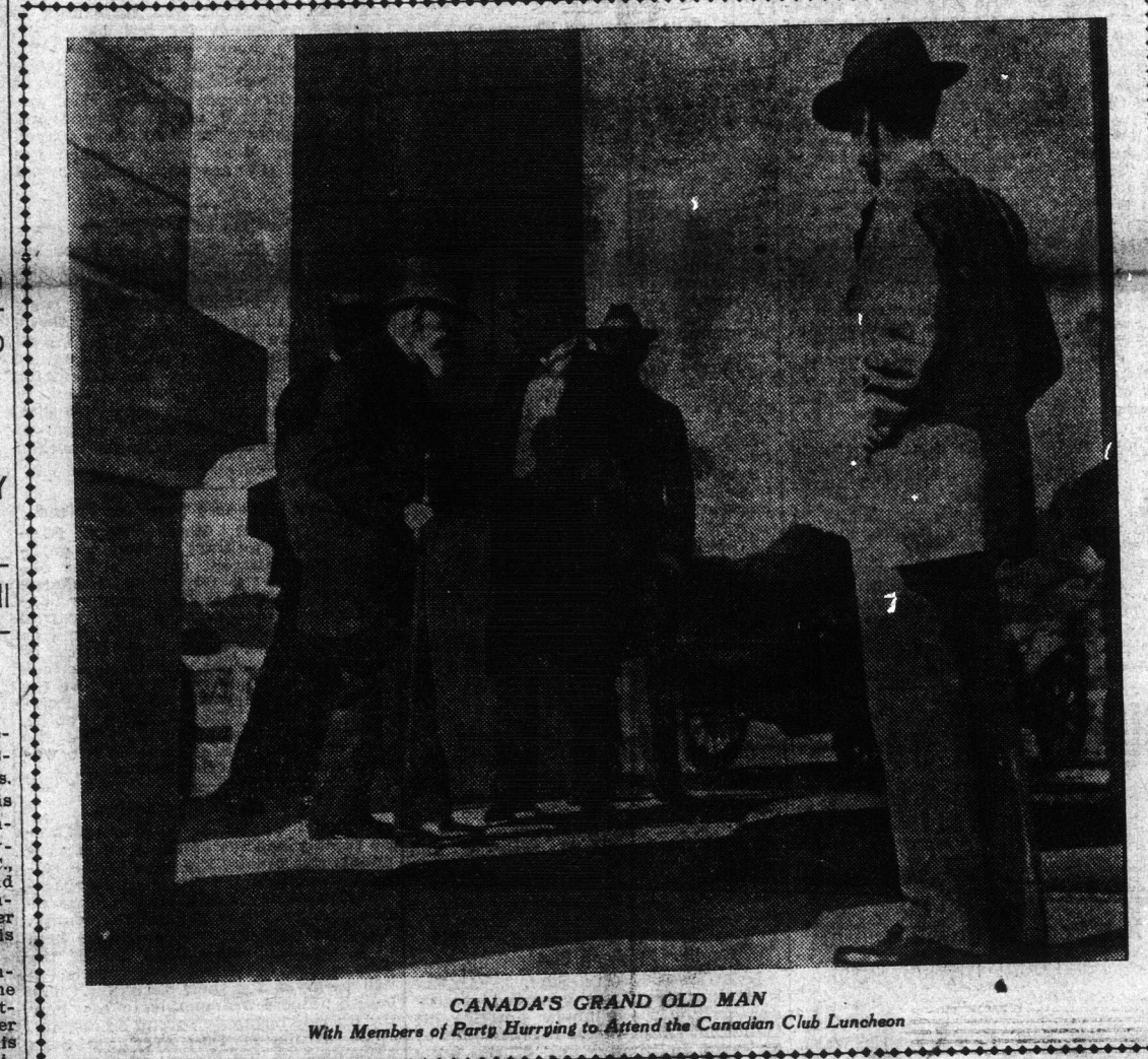
CANADA'S GRAND OLD MAN With Members of Party Hurrying to Attend the Canadian Club Luncheon