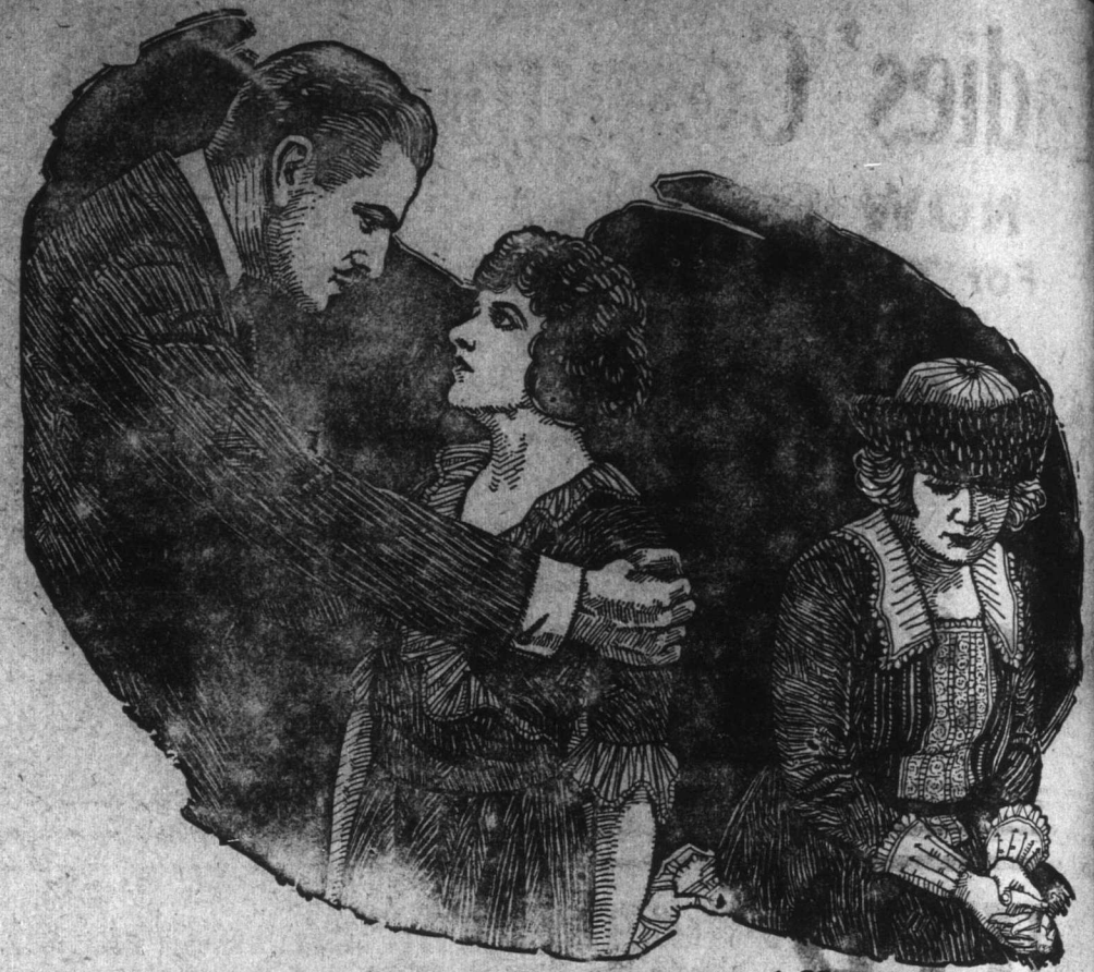
A PRIVATE SCANDAL

lines to work on radium production in Colorado. He was a captain in the chemical warfare service and since the war has been associate professor of chemistry at the University of Chicago.