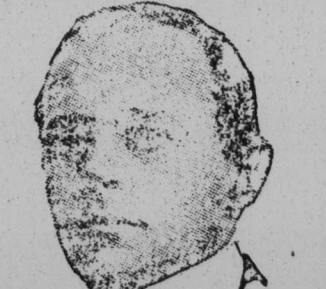
CAPT. R. F. SCOTT

That is the ambition of Capt. Scott, of the British navy. He has had experience in Antarctic exploring before, having headed the Discovery expedition in 1902.