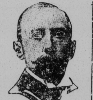
CAPT. ROALD AMUNDSEN

With time he ascended the huge Beardmore glacier, going up 10,000 feet above sea level, where crevices thousands of feet deep yawned for the intrepid explorers.