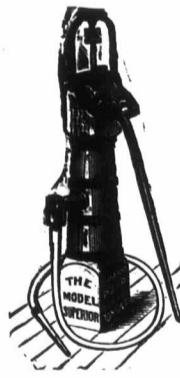
Pumps—Iron & Wood. Force or lift. Deep well pumps a specialty