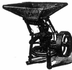
I X L FEED MILLS. The cheapest, most durable, and perfect iron feed mill ever invented.

ONTARIO PUMP CO., Gentlemen,—In regard to the 16-foot geared Wind Mill I bought of you, I can say it more than fills my expectations in every respect. In a fair to good wind I can saw wood at the rate of four cords of hard wood per hour, cut once in two. In a stiff wind I open the fans just half way and get all the power I require. In regard to your feed mill it is just grand. I have ground peas and oats at the rate of a bushel in three and a half minutes, and ground it as fine as one would wish for. I can grind fine corn-meal, also Graham flour. Have ground, since the 15th of February, 325 bushels of grain for customers, besides doing my own work with it. One man brought a grist of screenings, such as small wheat, mustard, and pussy grass seed, thinking that I could not grind it; but I ground it to powder, looking just like ground pepper. Your 15-foot geared mill, I think, is quite large enough for any farmer to do his own work. Yours truly, EDWIN KEELER, Maitland P. O.