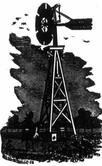
Halladay's Standard Wind Mills. 17 Sizes.

STATE WHAT YOU WANT AND SEND FOR ILLUSTRATED CATALOGUES.