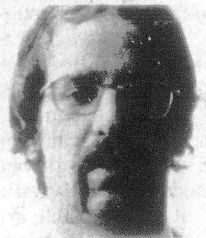
Bradford Ward 3

The president of the city's Rotary-Annes, who is also a member of city task forces on vandalism and human relations, promises to reveal the names of donors.