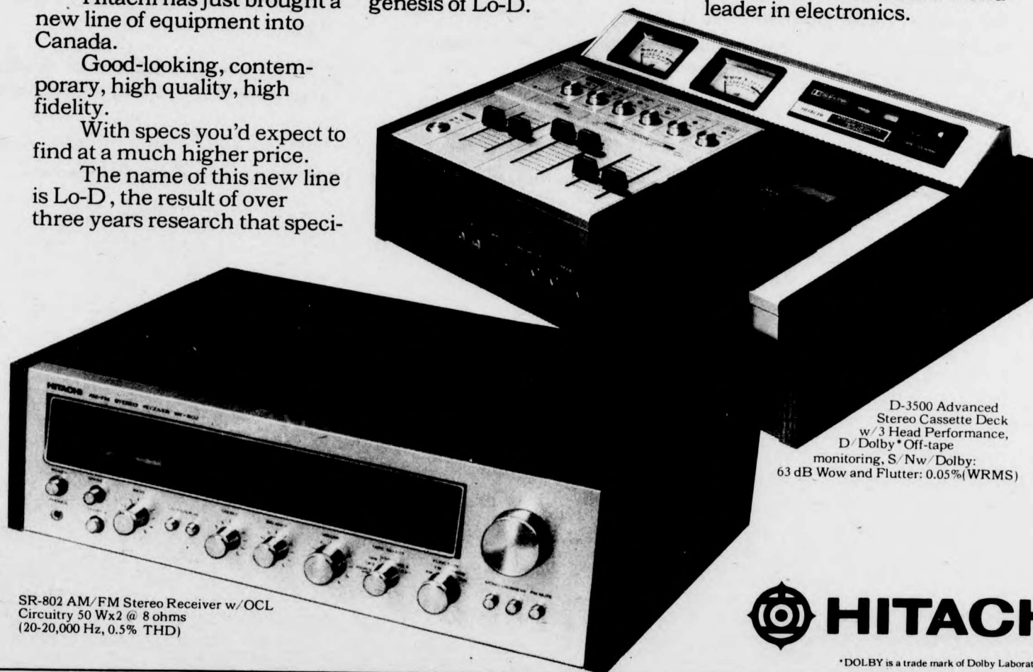
SR-802 AM/FM Stereo Receiver w/OCL Circuitry 50 Wx2 @ 8 ohms (20-20,000 Hz, 0.5% THD)

The kind of achievement that has made Hitachi a world leader in electronics.