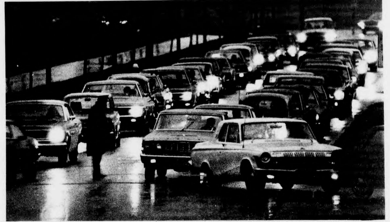
A standard scene at York during the academic year, which for Atkinson extends through the summer months, is the line-up of hundreds of cars carrying students arriving for evening classes. Growing demand means a future increase in the number of part-time students in Ontario.

important model. This weekend, Atkinson students have organized a three-day series of events — cultural, social and political — designed to signify the