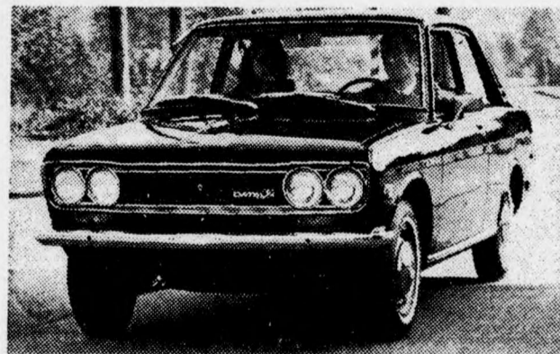
1971 DATSUN 1600 2-DOOR SEDAN

Read what the experts say about all these cars in Road & Track's January issue — and then give them a test drive yourself. We'd be happy to let you give our Datsuns a whirl any time from 9:00 a.m. to 10:00 p.m.