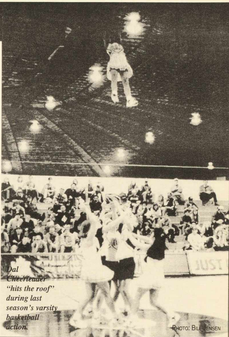
Dal Cheerleader "hits the roof" during last season's varsity basketball action.