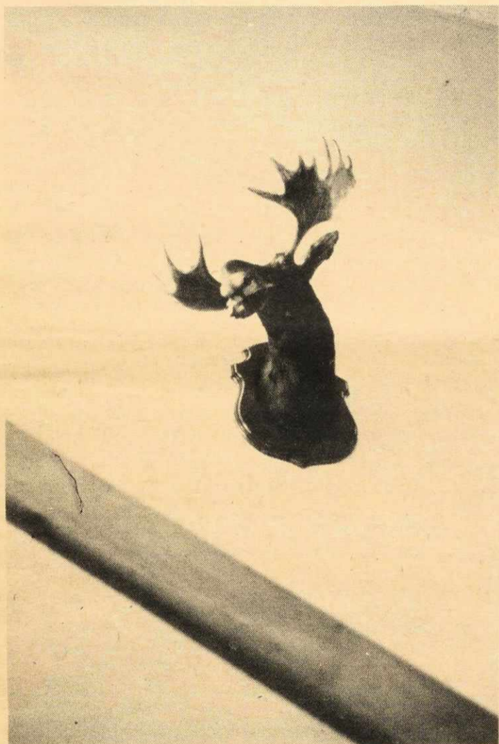
The company symbol is neither gone nor forgotten in Dartmouth.

There is little or no waste involved in the beer business, and Moosehead wishes there was less. They would save $100,000.00 a year if all bottles sent out were returned. Each bottle can be used 22 times. The cardboard cartons that bottles are returned in are baled by Moosehead for recycling. The various end products of the process such as the used barley and brewers' yeast are used in agriculture, often for feeding animals. Every effort is made to keep draft beer constantly cold from the time it is made to the moment it is drawn in a tavern. Bottled beer is made to have the longest possible shelf life.