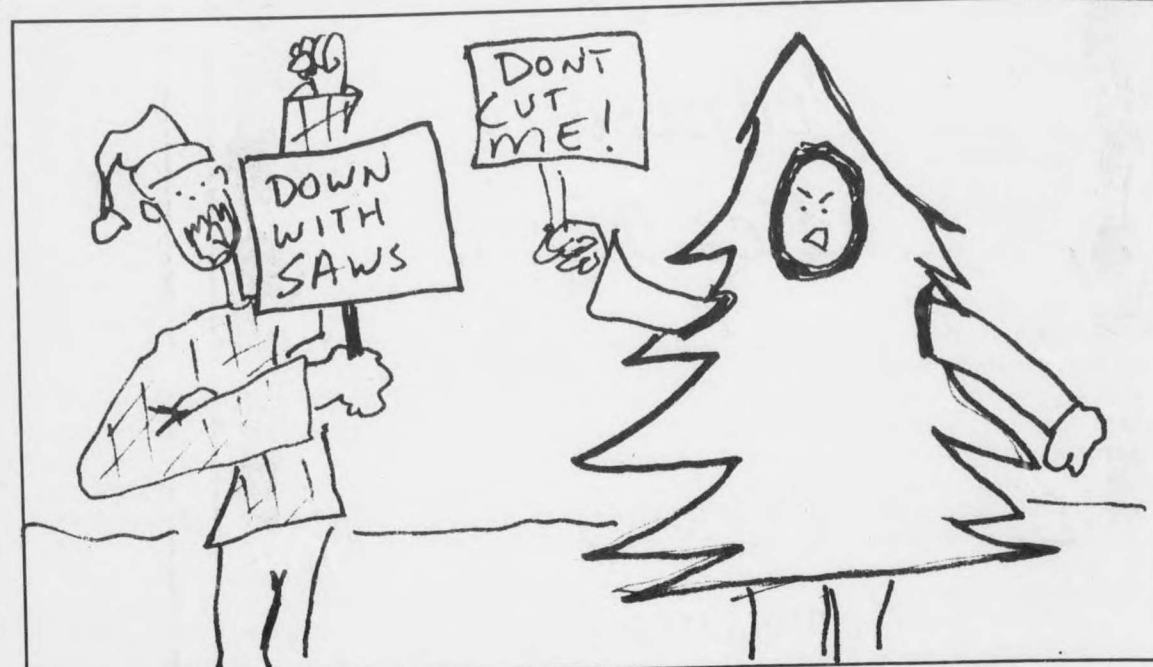
The debate between sappy treehuggers and chainsaw wielding foresters continue