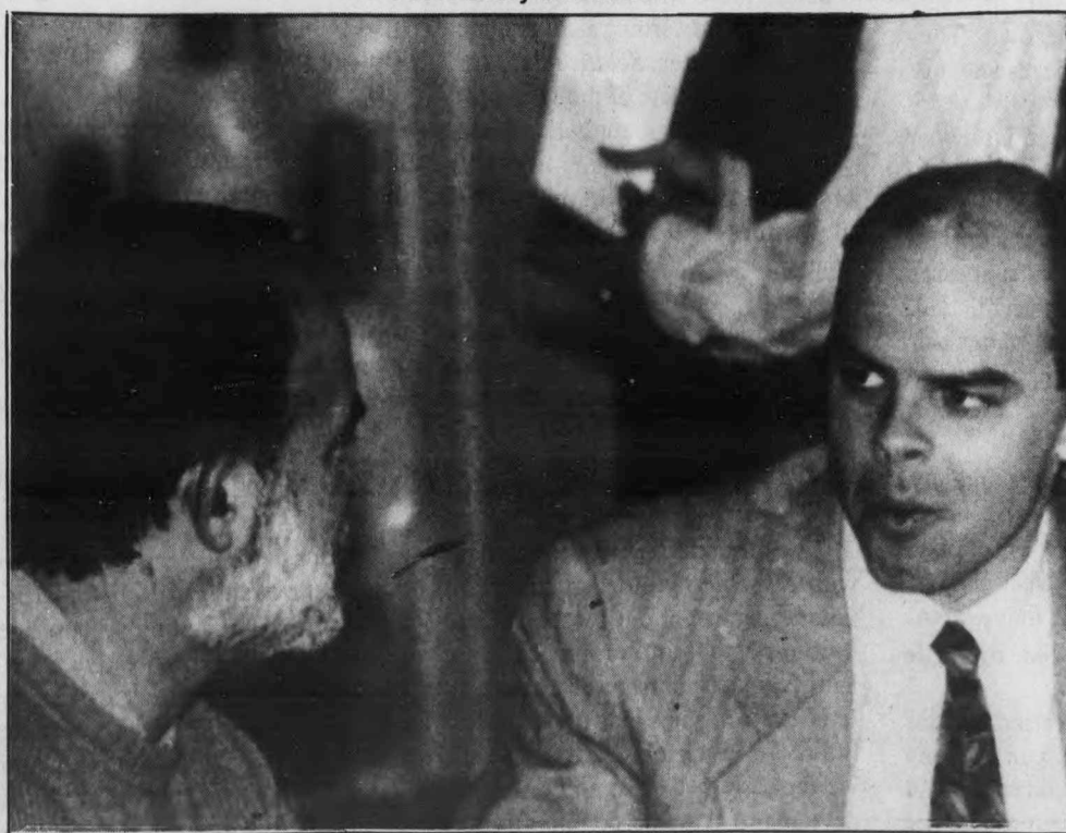
The Two Proud recipients