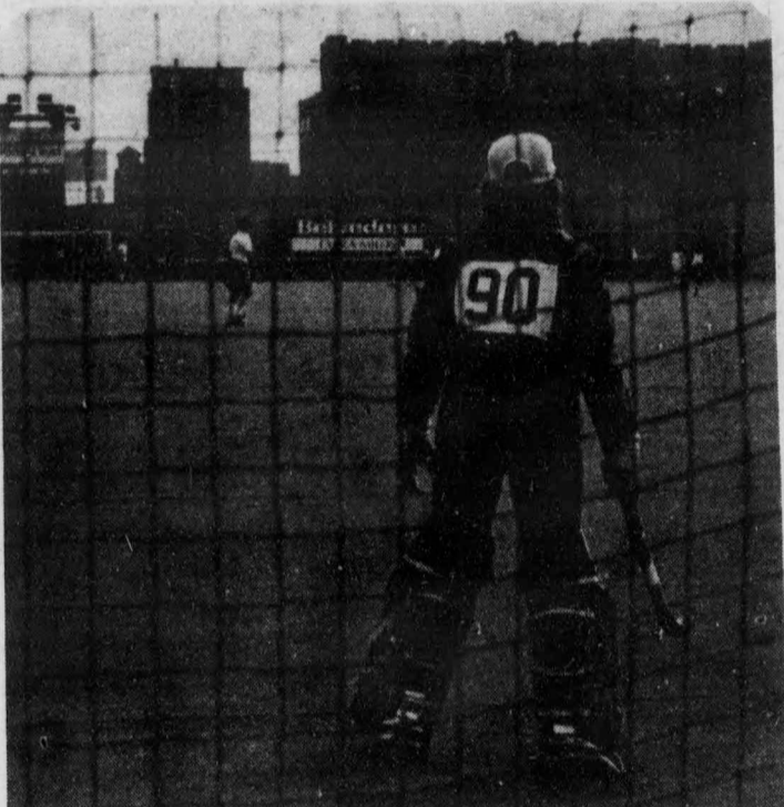
View from the goal