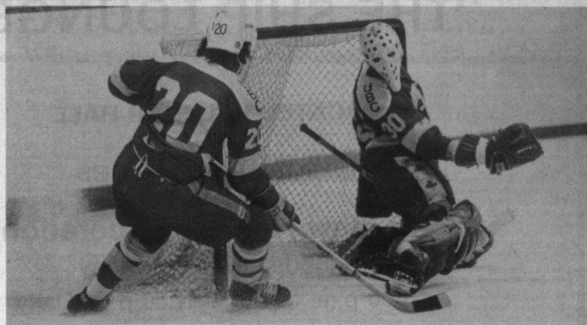
UBC finished strong but Bears are in playoffs.

The UBC contests may not have been crucial to the master plan for playoff success, but they see next page