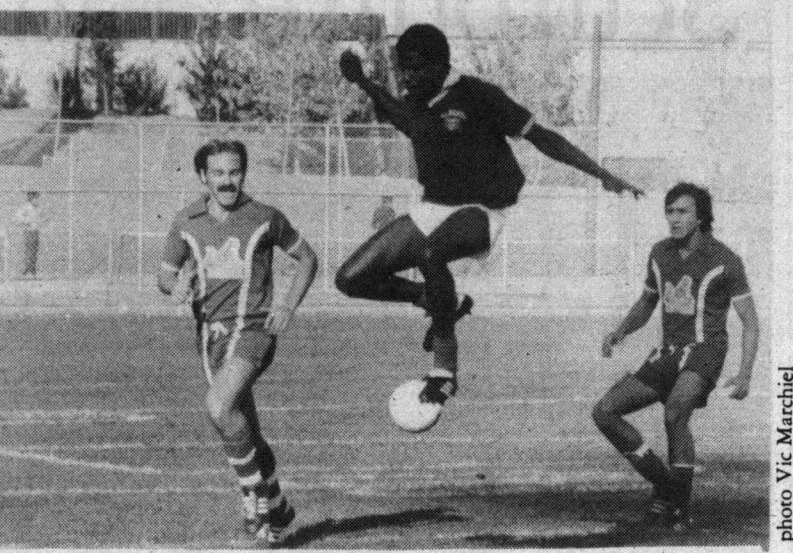
Alberta Bear goes high for ball. Keep those knees up!

After a not very convincing 13 and forcing Calgary's