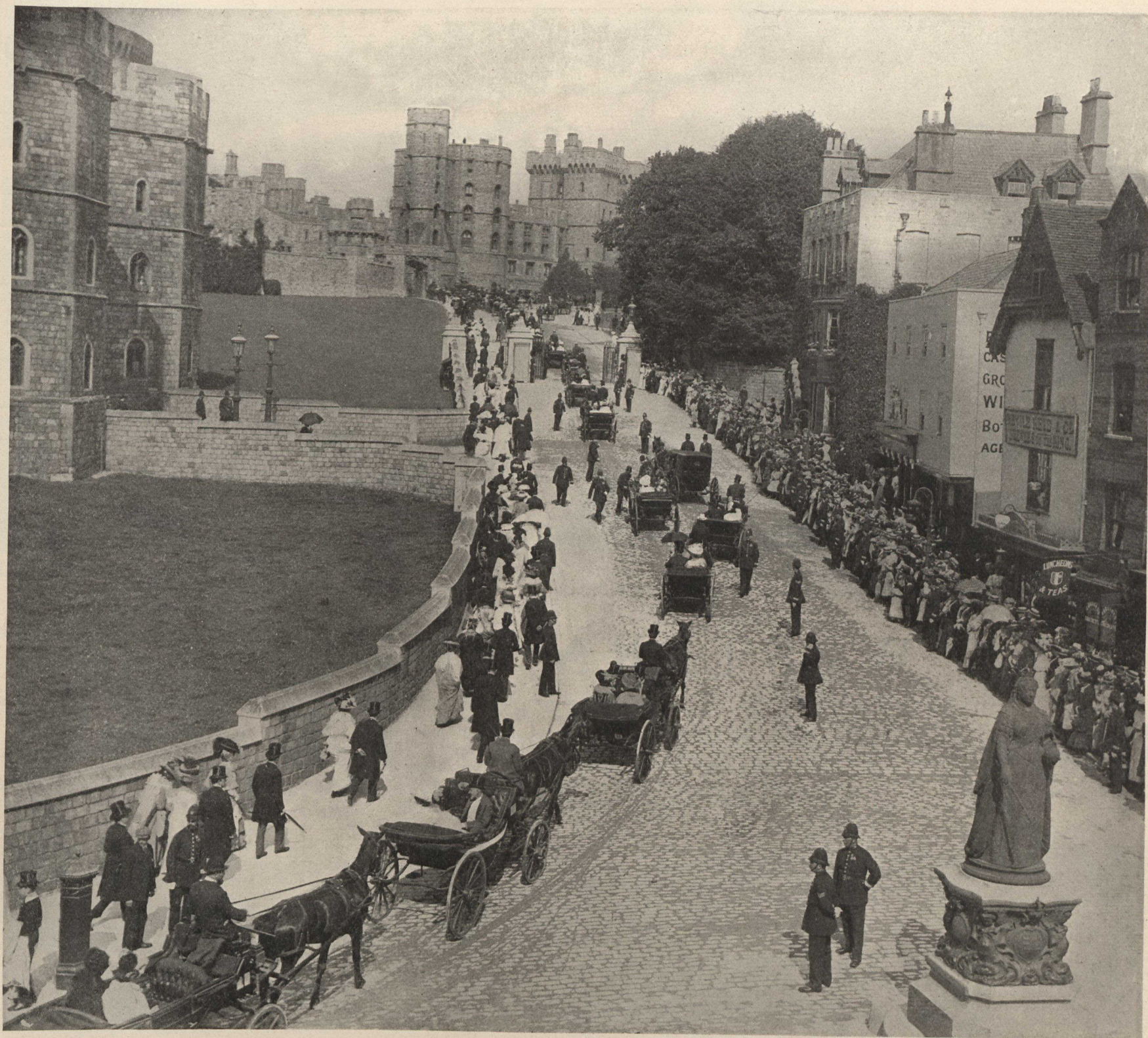
The Public Entrance to Windsor Castle, where nine thousand guests were entertained at the King's Garden Party, the closing of Ascot Week.