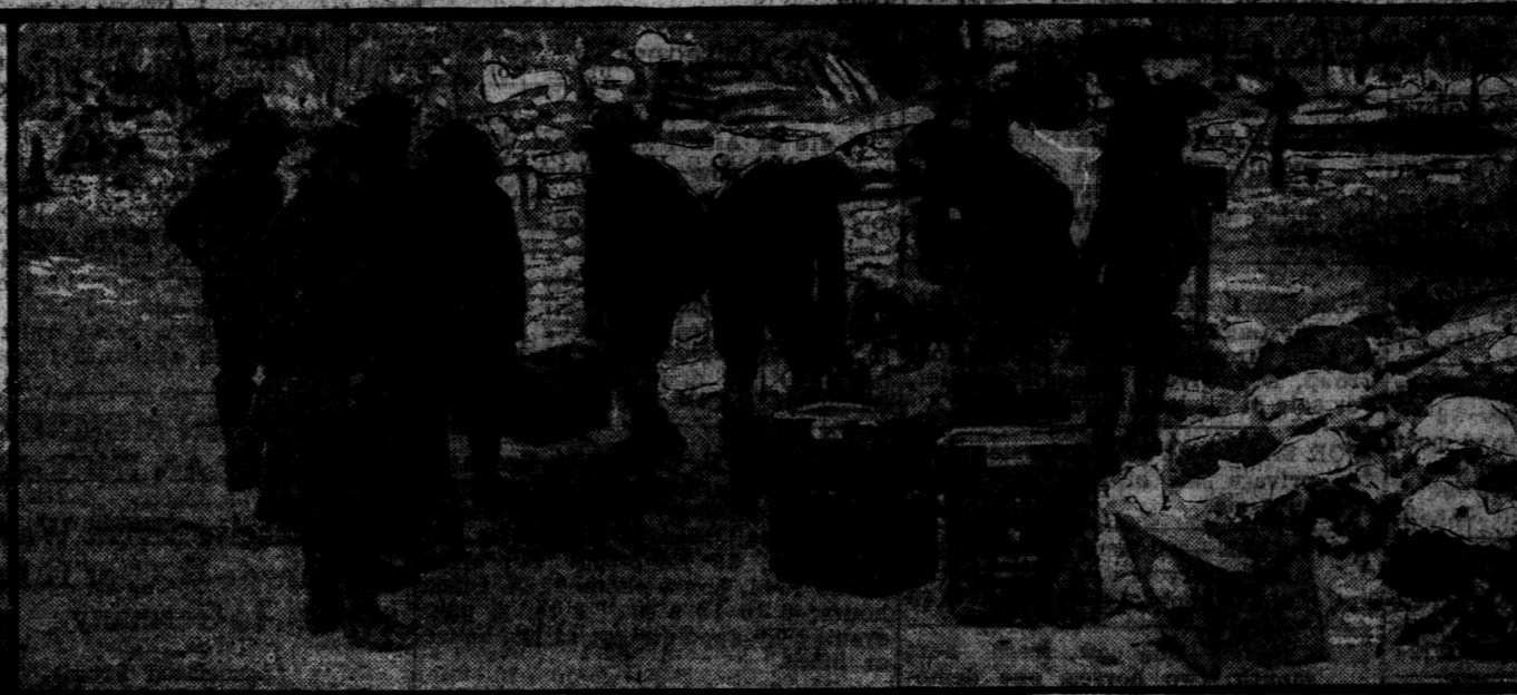
On the British Western Front.—Cold work in the new filling cans of a water point.