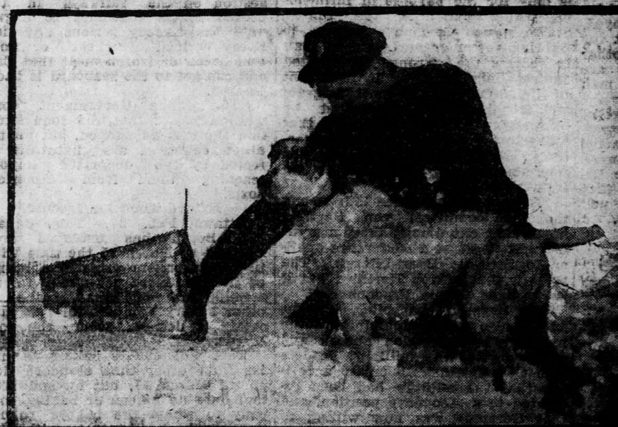
Jack, the mascot, stops playing to watch the departure of a lorry and wonders why he is not there, as he always takes his trip to the front every night.