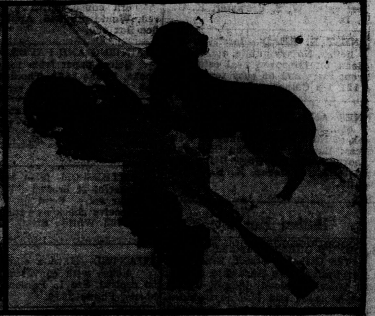
Guarding his dog's life.