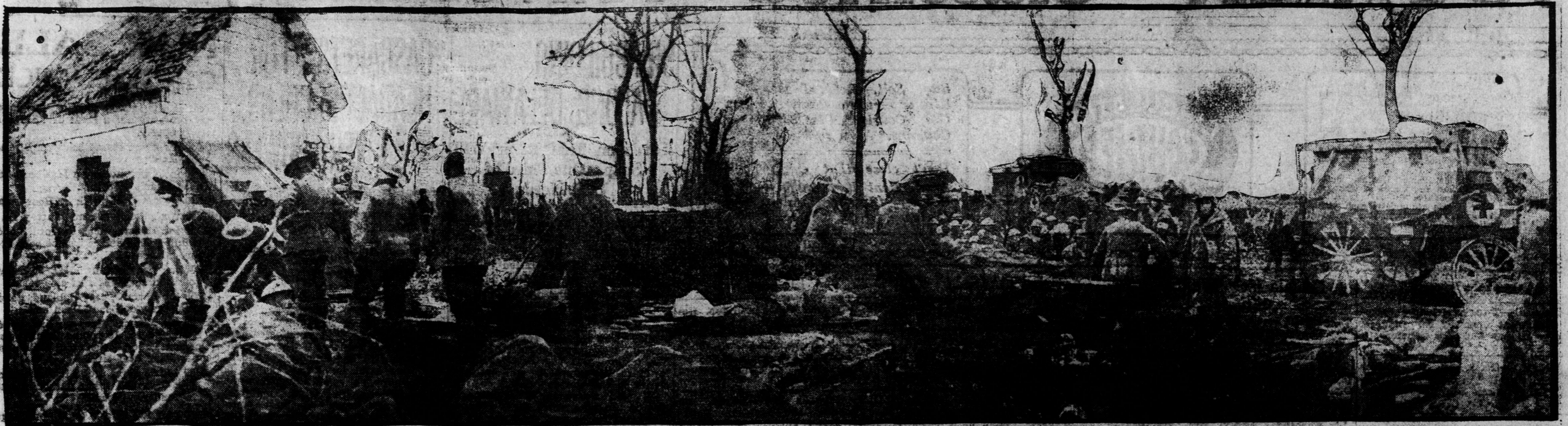
Photograph taken on the Western Front in France.—A scene at an advanced dressing station during the battle.