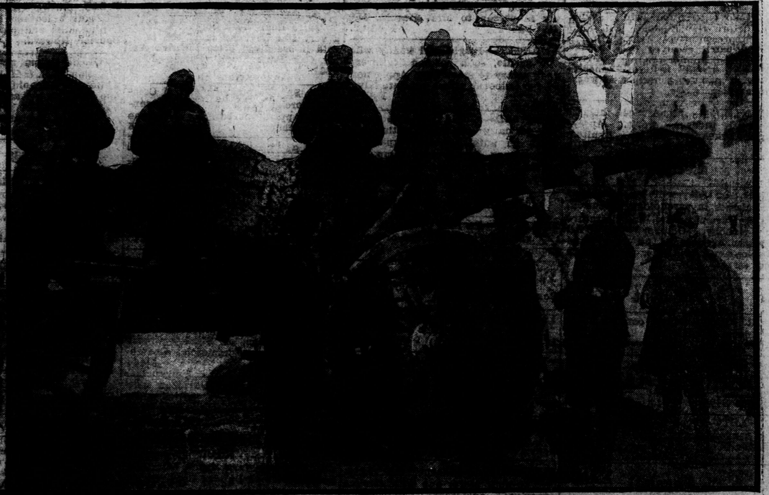
British Official Photo From Italy.—A scene on the roadside. —Photo by Courtesy of G. F. R.