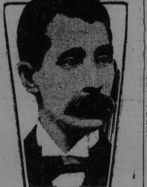
LORD MINTO APPRECIATED

Tokio, Dec. 9.—The resignation of Count Komura, minister of foreign affairs, must be regarded as an event of the not far distant future. Protracted ill health may be given as the primary cause leading up to that which will be generally regarded in Japan as an unfortunate necessity. It has been an open secret that differences of opinion exist between Marquis Katsura and his minister of foreign affairs. The new tariff law, enacted this year, will go into effect next July, and the negotiations for conventions form the ground work for those differences. Perhaps the effect of the statutory tariff upon foreign relations was not given sufficient consideration, but at any rate Japan's foreign affairs, has been giving much trouble to the foreign office in this connection.