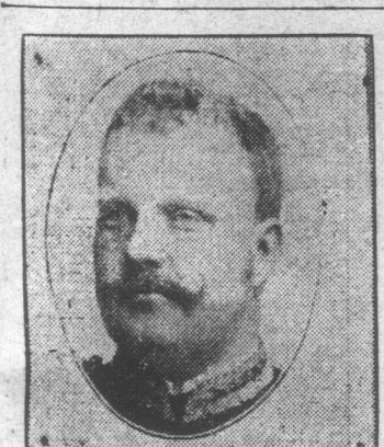
Don Carlos, the Late King of Portugal.

Portugal, and Crown Prince Luiz Phillippe were assassinated to-day and the city is in an uproar. The king's son. Prince Manuel, was