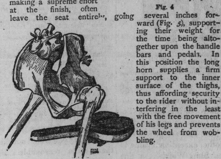
Fig. 4 ward (Fig. 5), support-ing their weight for the time being altogether upon the handle bars and pedals. In this position the long horn supplies a firm support to the inner surface of the thighs, thus affording security to the rider without interfering in the least with the free movement of his legs and prevents the wheel from wob-

considerable weight upon Finally, it is well known that racing men, when making a supreme effort at the finish, often