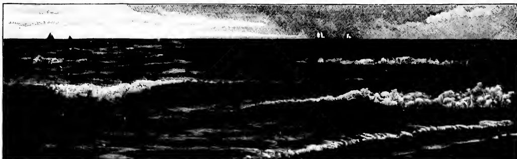
The Wide, Wide Ocean.

Please examine the picture below. If you have never seen the real sea, nor any great lake, take a long look at this picture of the wide, wide ocean . Do you ask which way the sea lies from where we live? Well, it lies every way you can go, for the ground , or land , on which we walk ends on all sides at the sea. Look at the water in the picture; look at the sky. Do you see the line where they seem to meet? That is the sky-line, or we call the horizon . Go up to the top of a high hill and you will see this sky-ring around where the sky seems to bend down to the land on all sides. You can see that the land ends at the edge of the sea in the picture. Let us set off towards the east and try to find the end of the real land. We shall walk to a railway station and take an east-bound train. The sky-ring, or horizon, keeps ahead of us all the way on the land, but at last we see it stretching over the dark-blue water of the wide sea, which seems to grow broader as we come close to it. Our train has to stop because we are at the