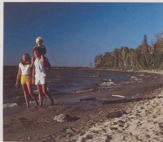
Self-planned tours can include visits to Canada's many beaches.

This is a 13-day fly/cruise/coach tour that takes in some of the most spectacular scenery that Canada has to offer. It starts in Vancouver and takes travellers to Vancouver Island to Ksan — an authentic Indian village — and on a leisurely trip