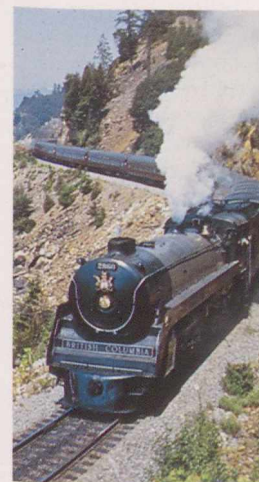
The Royal Hudson steam special makes the return trip from Vancouver to Squamish daily.

Some of the motor-homes have to be returned to the city of departure, but others can be collected in one city and dropped off in another.