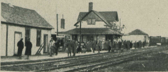
SOLDIERS ON LEAVE AT CANADIAN NORTHERN STATION, VALCARTIER.