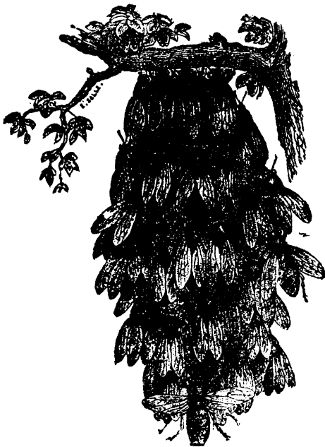
FIG. 4.—CLUSTER OF BEES.