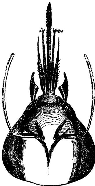
FIG. 9.—HEAD OF THE HIVE BEE (magnified.)