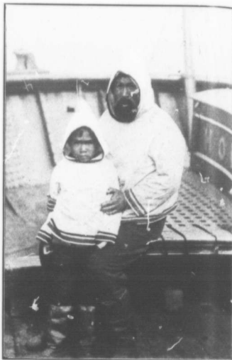
NEWFOUNDLAND—An Eskimo father and son on board the mail steamer "Home."