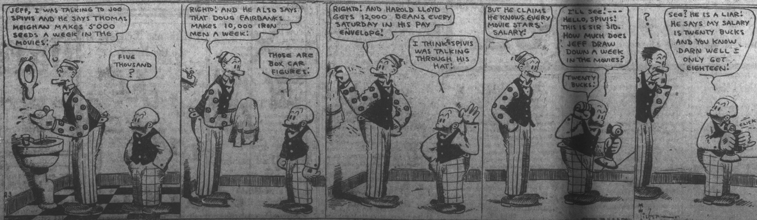
MUTT AND JEFF AT THAT, SPIVIS MADE A CLOSE GUESS. —By Bud Fisher.

JEFF, I WAS TALKING TO JOE SPIVIS AND HE SAYS THOMAS MEIGHAN MAKES 5000 SEEDS A WEEK IN THE MOVIES.