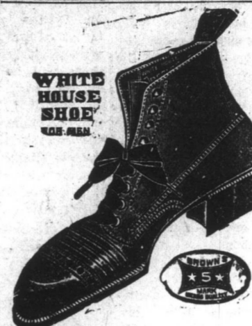
WHITE HOUSE SHOE