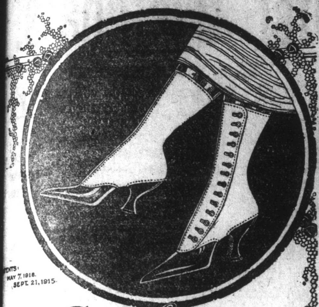
Glove fitted Tweedie Boot Tops

THE ORIGINAL You will wear TWEEDIES for their comfort, fit and good style. Wonderfully effective different and distinctive Unconsciously women who wear them accept the word TWEEDIES. EVERY PAIR GUARANTEED In the newest shades and style conceptions.