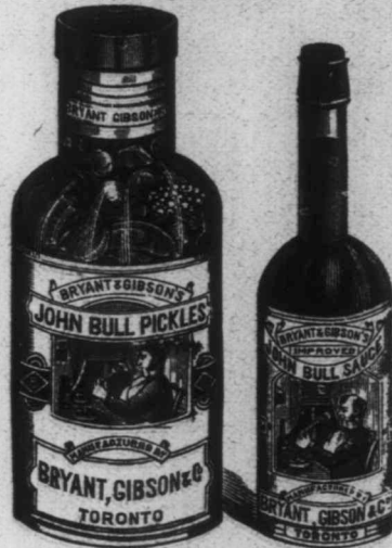
This is a facsimile of our bottles. "Worcestershire Sauce," "Yorkshire Sauce" "Devonshire Relish" Raspberry Vinegar, Eva- porated Vegetables, Chocolates, Coconuts, Confectionery.

BRYANT, GIBSON & Co., TORONTO, Manufacturers of