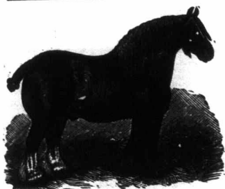
For Sale Clydesdale Stallion,