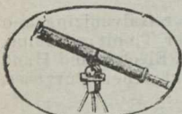
Re. Istered Trade Mark.

Locks in all qualities for Cabinet Makers, Sash Fasteners, Locks & Brassfoundry for Builders' Ironmonger. ALL KINDS OF KEYS MADE on the PREMISES.