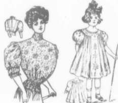
5610 Guimpe Blouses, 32 to 42 bust. 6615 Child's Dress, 2, 4 and 6 years.

In this day of over-waists and jumpers, the guimpe fills an important place in the wardrobe. Here is one that can be entirely of lace or of some pretty lingerie material or of muslin with facings and sleeves of lace as liked. The latter method is, as a matter of course, a bit more economical and when costly material is used is in every way desirable, although the entire garment always possesses certain inherent advantages. In this instance imitation Irish crochet is the lace chosen and the sleeves are cut off at the elbows and shirred to form puffs with frills of thinner lace making the finish. But deep cuffs can be added, making the sleeves full length and every material that is