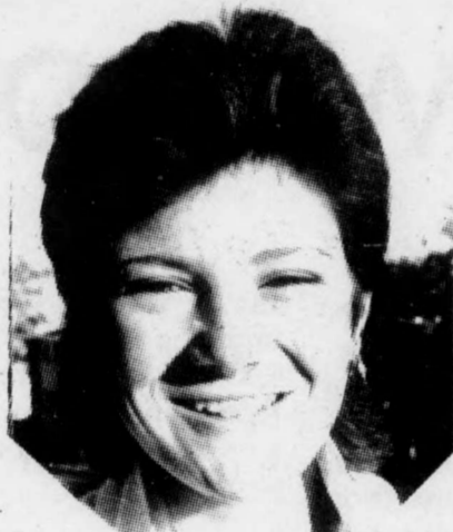
C. West P. Ed III Walking a total stranger from Neil for Breakfast.