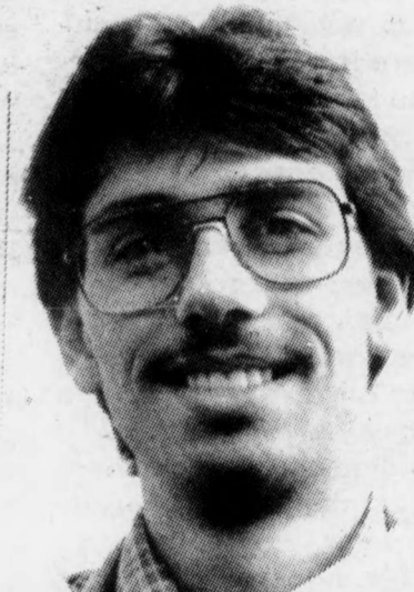
P. Theriault BSc F I Opening my door to find a strange girl asking me to breakfast.