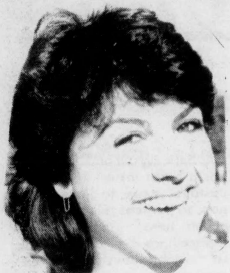
Kyte Grad 83 Panty Raids back in the good old days!

What was your most embarrassing experience from Frosh Week?