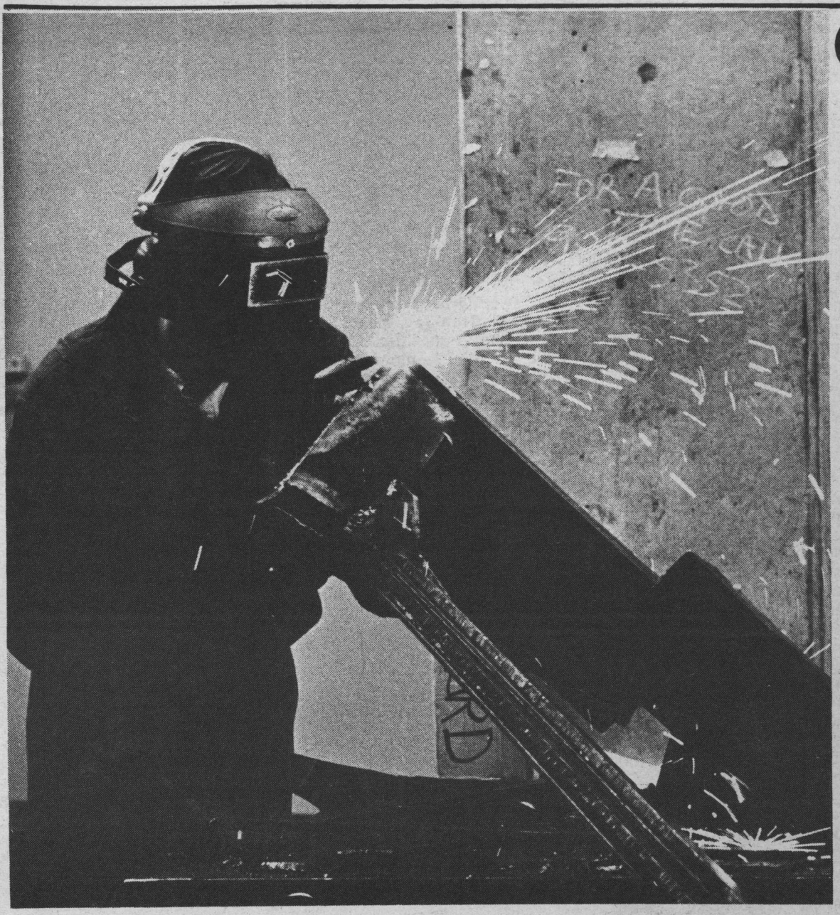
A Master of Fine Arts student producing a metal sculpture. Who says art isn't work?