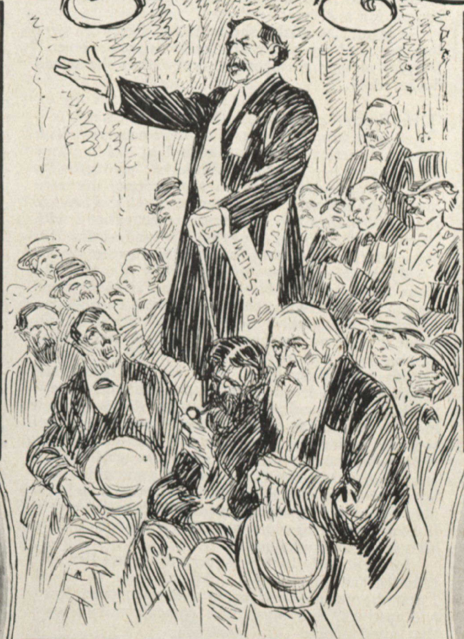
ONE OF THE SPEAKERS