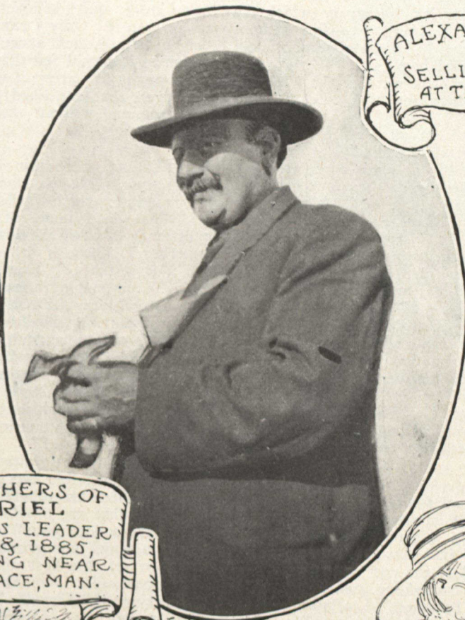
TWO BROTHERS OF LOUIS RIEL THE METIS LEADER OF 1870 & 1885, NOW LIVING NEAR ST. BONIFACE, MAN.