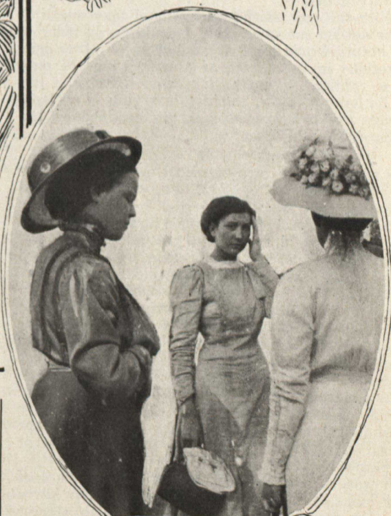
TYPES OF THE NEW WOMAN AMONG THE METIS

THE first gentry of the plains are here typified by the artist who saw them just the other day; reminded of the time when in the half-breed shacks along the trail were found most of the real manners of the fur-post land; when on the trail every Metis lifted his cap to the priest or the white stranger. Though some of the manners may have gone the jollity and bonhomie and dignity are all remaining in these ancient aristocrats of the prairie. They are still fond of oratory and of a long story over a sociable pipe.