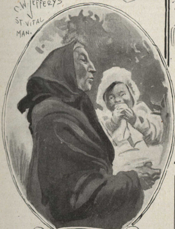
THE OLD TYPE OF THE METIS WOMAN